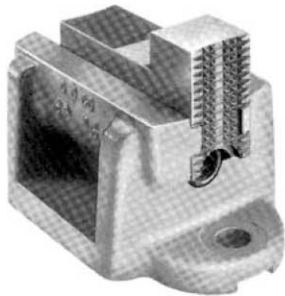
Series 10-063 Steel Bodies Set of 4 with Solid Reversible Jaws