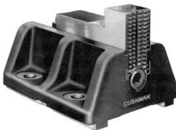
Series 10-073 Steel Bodies Set of 4 with Solid Reversible Jaws